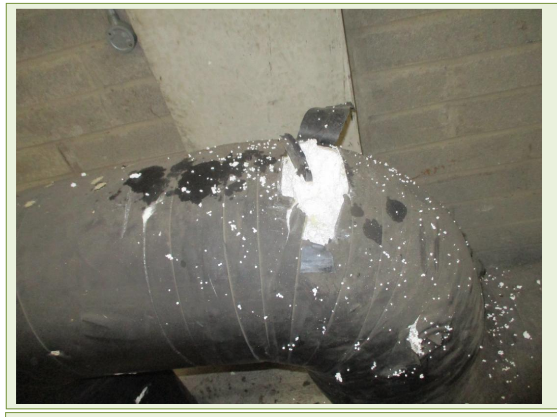
Polystyrene insulation on cold lines. No ACM's detected