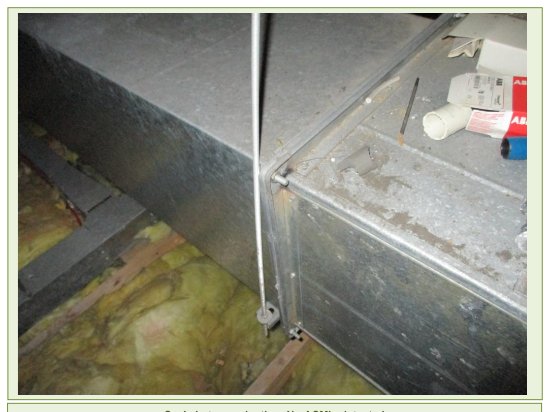
Seals between ducting. No ACM's detected