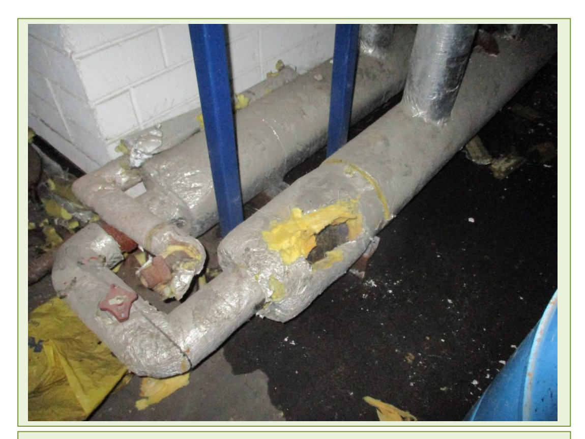
Fiberglass insulation in plant room. No ACM's detected