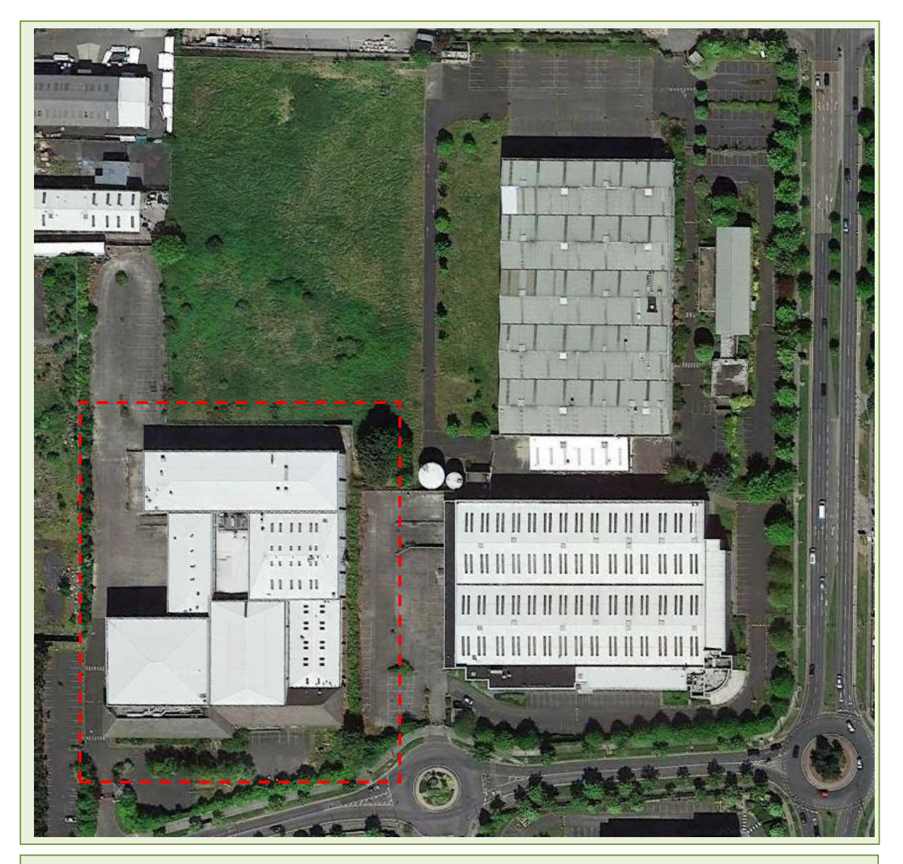
Former Cuisine De France Site, Belgard Road, Tallaght, Dublin 24