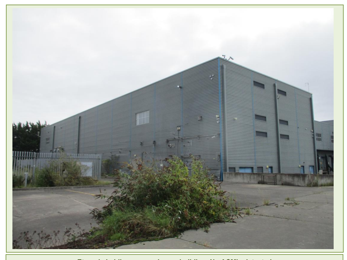
Eternal cladding on warehouse building. No ACM's detected