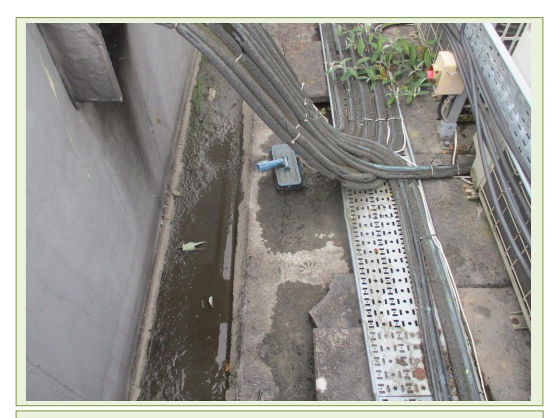
Felt on flat roof area of office block. No ACM's detected