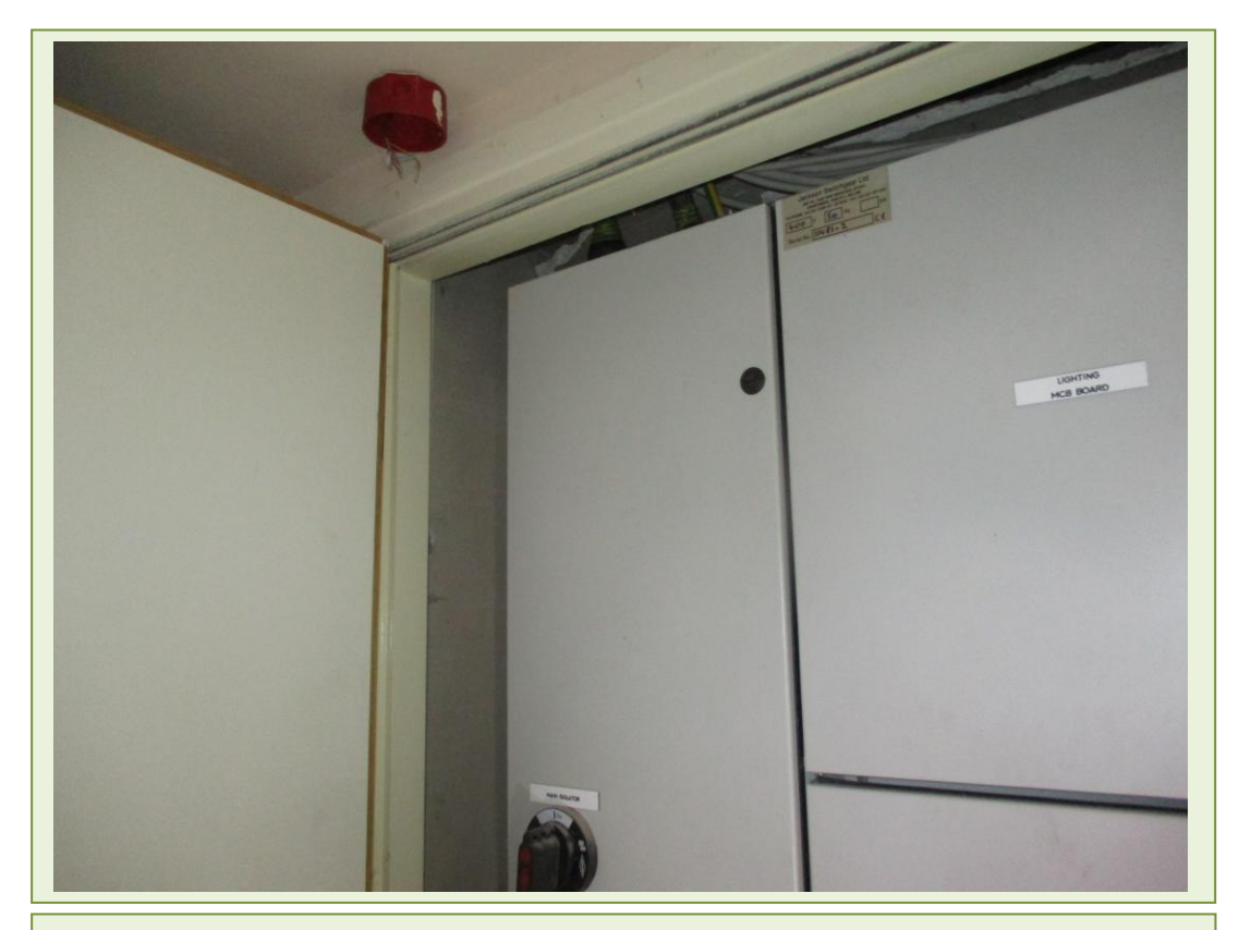
Board around electrical panel. No ACM's detected